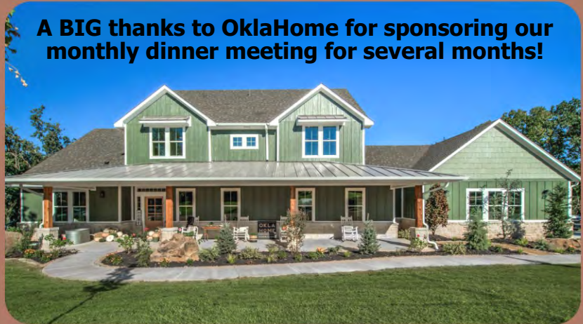
A BIG thanks to OklaHome for sponsoring our monthly dinner meeting for several months!