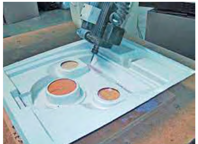
Plane Plastics