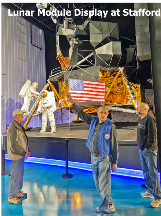
Lunar Module Display at Stafford